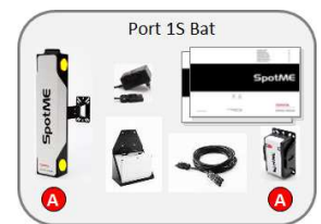
Kit with Battery (for demo purpose) Parts N° 7547951