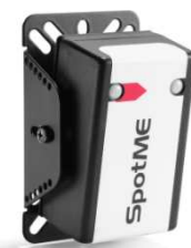
IR Sensor Indoor